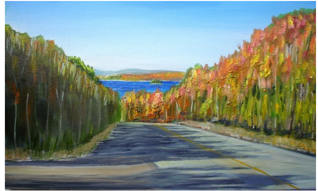
(Fall, Kennis Lake, Haliburton Ontario)

Painting is an inexpensive hobby that I encourage you to try. The rewarding moment occurs when you are able to find the "zone," and upon completion, sit back and realise you captured the moment ... not simply what a camera would see.